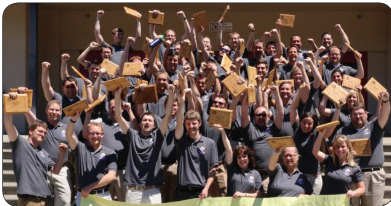
The 2016 ABC grad class celebrating after the certification ceremony.