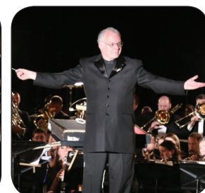
To the Max (On the Truck)