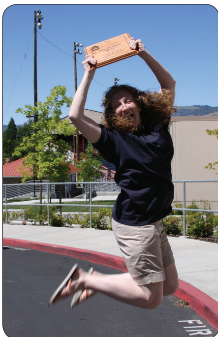
Celebrating after the Certification Ceremony