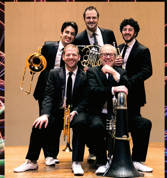
Canadian Brass, Guest Ensemble