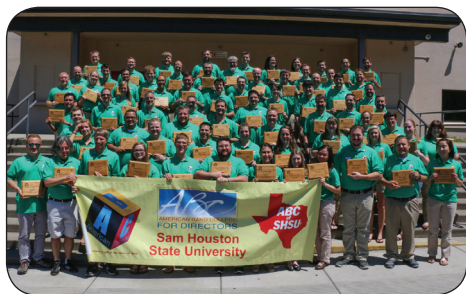
SHSU's ABC Grad Class of 2017