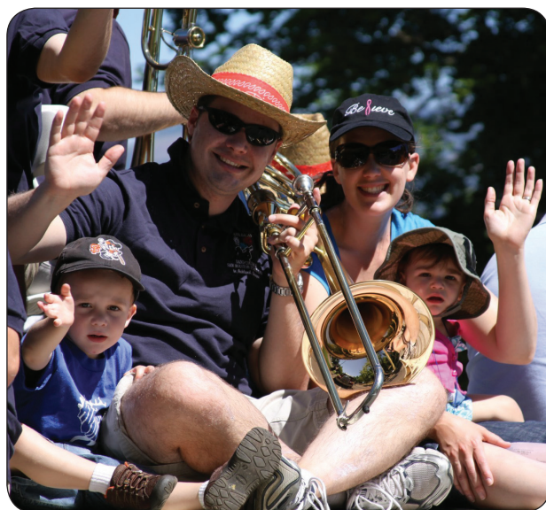
ABC families celebrate "On the Trucks" • 4th of July