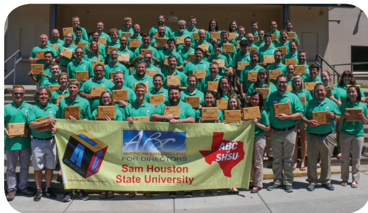
ABC Graduate Class of 2017

Do it today and let us thank YOU for your support of the American Band College program now celebrating its 30th year.