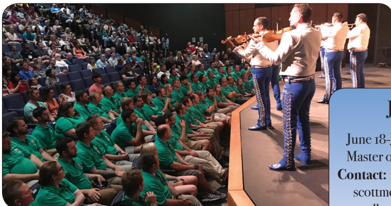
Mariachi Sol de Mexico at the July 3 ABC Certification ceremony.