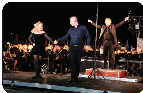
de Meij's Riverdance Finale 2016