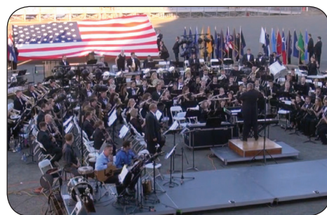
2016 Premier "That our flag was still there"

As early as 1990, ABC frequently did first performances of new pieces written by Hollywood composer, Warren Barker.