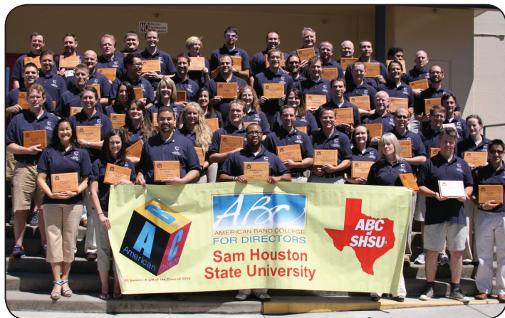
ABC Graduate Class of 2012

In 2018, the American Band College, via a new partnership being developed with Central Washington University, will graduate nearly 50 master's degree candidates. This will bring the total number of graduates since 1994 to more than 1000 band directors.