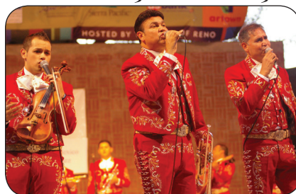
Mariachi Sol de México