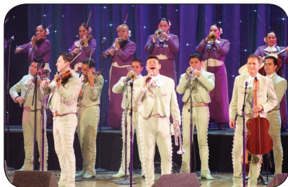
Mariachi Sol de México