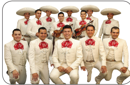
Mariachi Sol de México