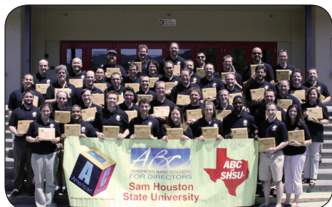
ABC/SHSU GRAD CLASS OF 2014