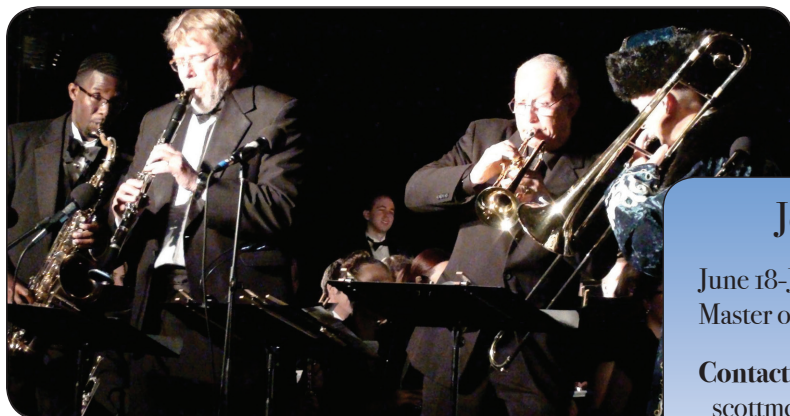
The ABC Dixieland Band at the July 4th concert.