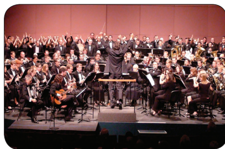
DE MEIJ 2010 FINALE: AT KITTY O'SHEA'S

As early as 1990, ABC frequently did first-performances of new pieces written by Hollywood composer, Warren Barker.