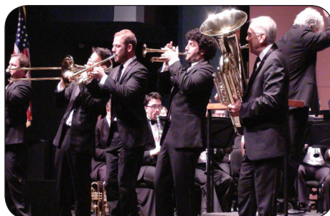
CANADIAN BRASS WITH ABC IN 2014