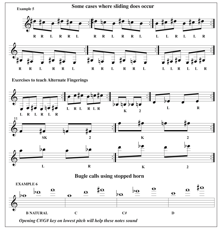
Examples 5 & 6