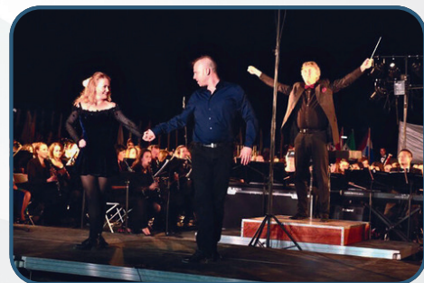
Johan de Meij's Riverdance Finale, 2016