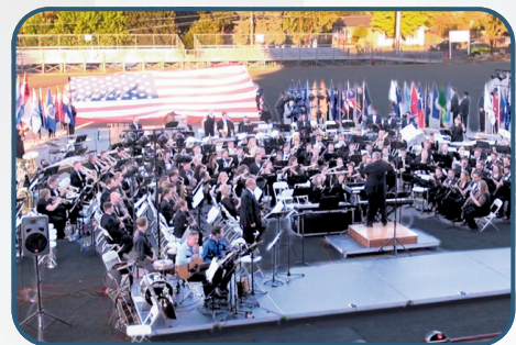
2016 Premiere "That Our Flag Was Still There"