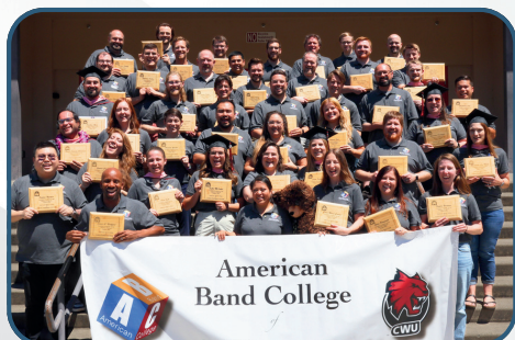
The ABC Graduating Class of 2024