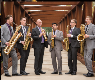
The Moanin' Frogs Saxophone Ensemble