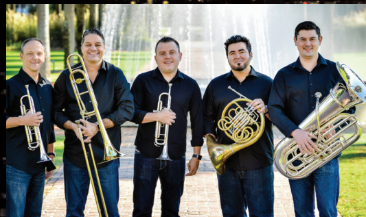
Boston Brass Guest Ensemble