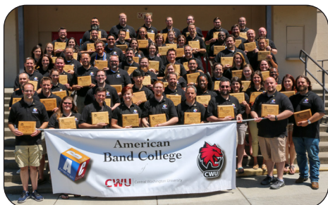
The ABC Grad Class of 2019