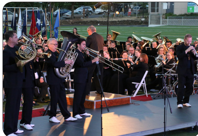
Canadian Brass with the 200 members of the American Band College combined Directors' Bands, July 4, 2018.