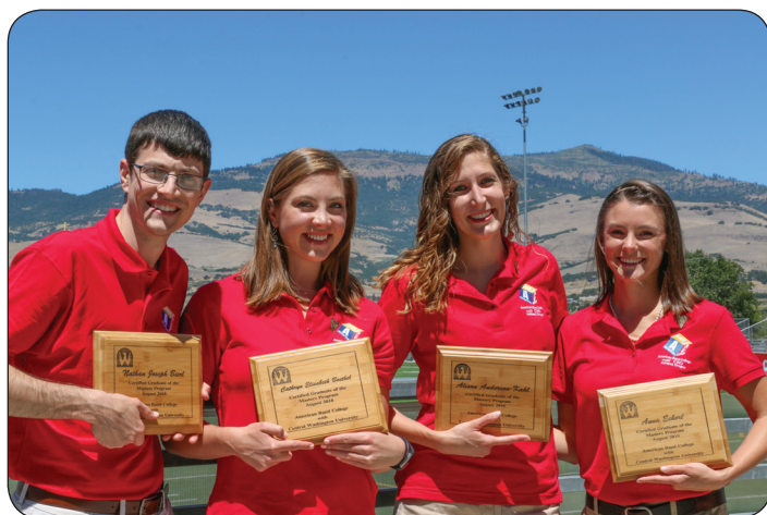
Celebrating after the 2018 Certification Ceremony