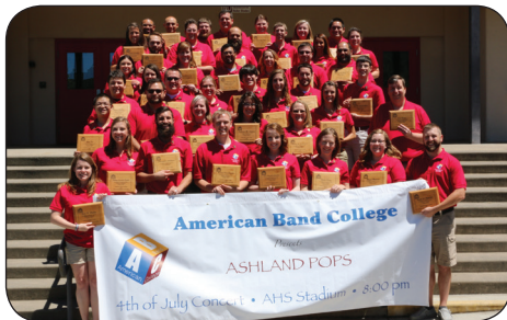
The ABC Grad Class of 2018